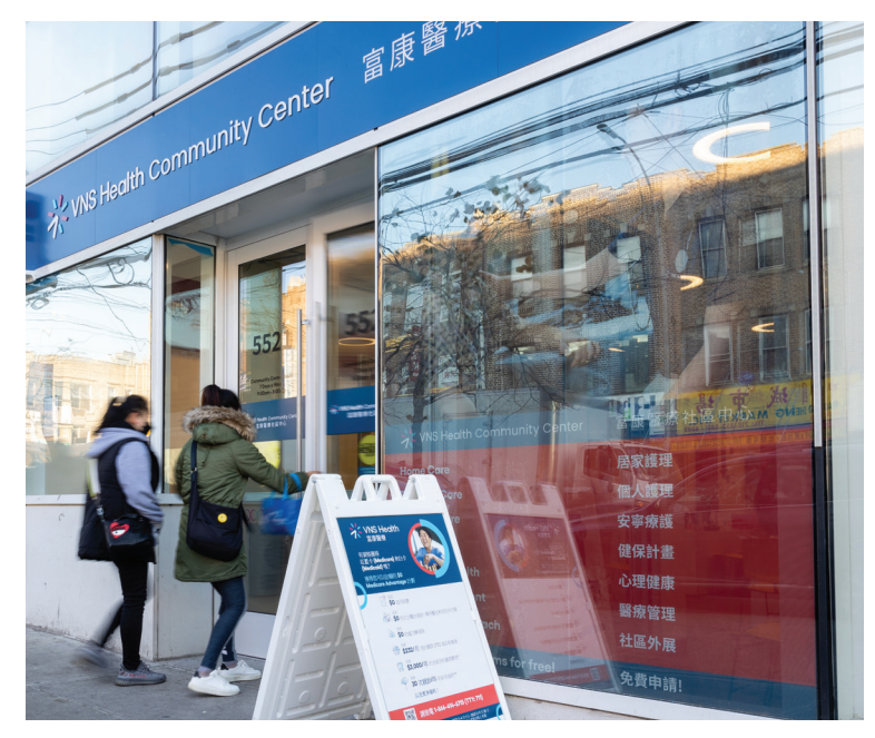
Like VNS Health's Chinatown Community Center, the organization's two new centers are focused on helping local community members, especially seniors, live safely and independently at home.